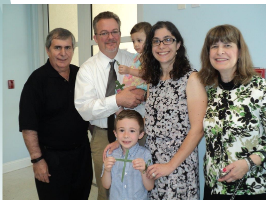
St. Photios Friends - The Lemieux family