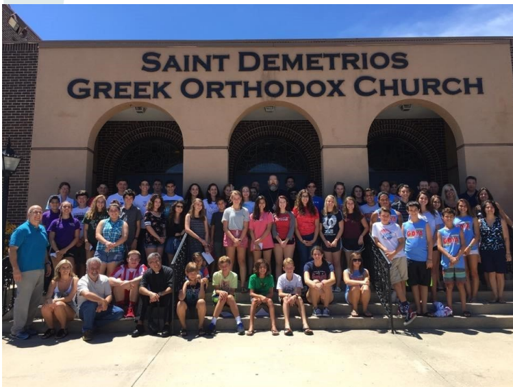
St. Demetrios Greek Orthodox Church, Daytona, FL 2016 Beach Reach