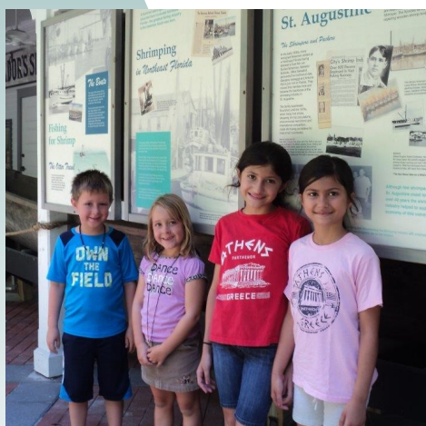
The children of Holy Trinity, St. Augustine, taught the campers Greek Dancing and then the children learned about the legacy of the Greek shrimp boat builders who came to St. Augustine in the early 1900's from Simi, Greece.