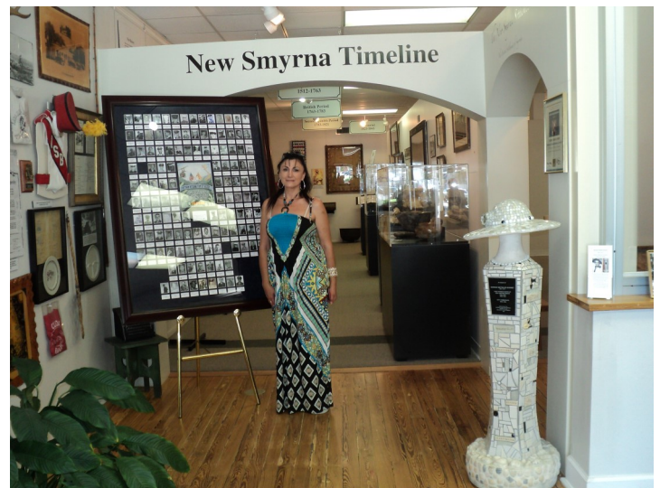
Visiting the New Smyrna Historical Society Museum