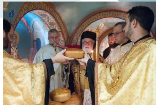
Blessing of the Five Loaves Celebrating the Feast of St. Photios the Great, Ecumenical Patriarch of Constantinople