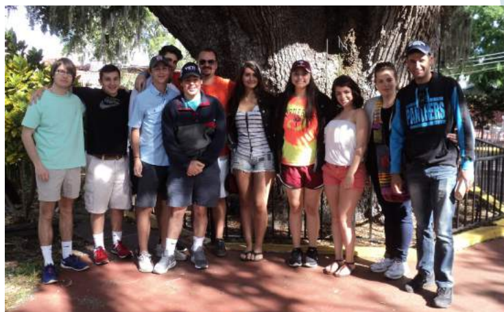
Holy Trinity, Charlotte, NC