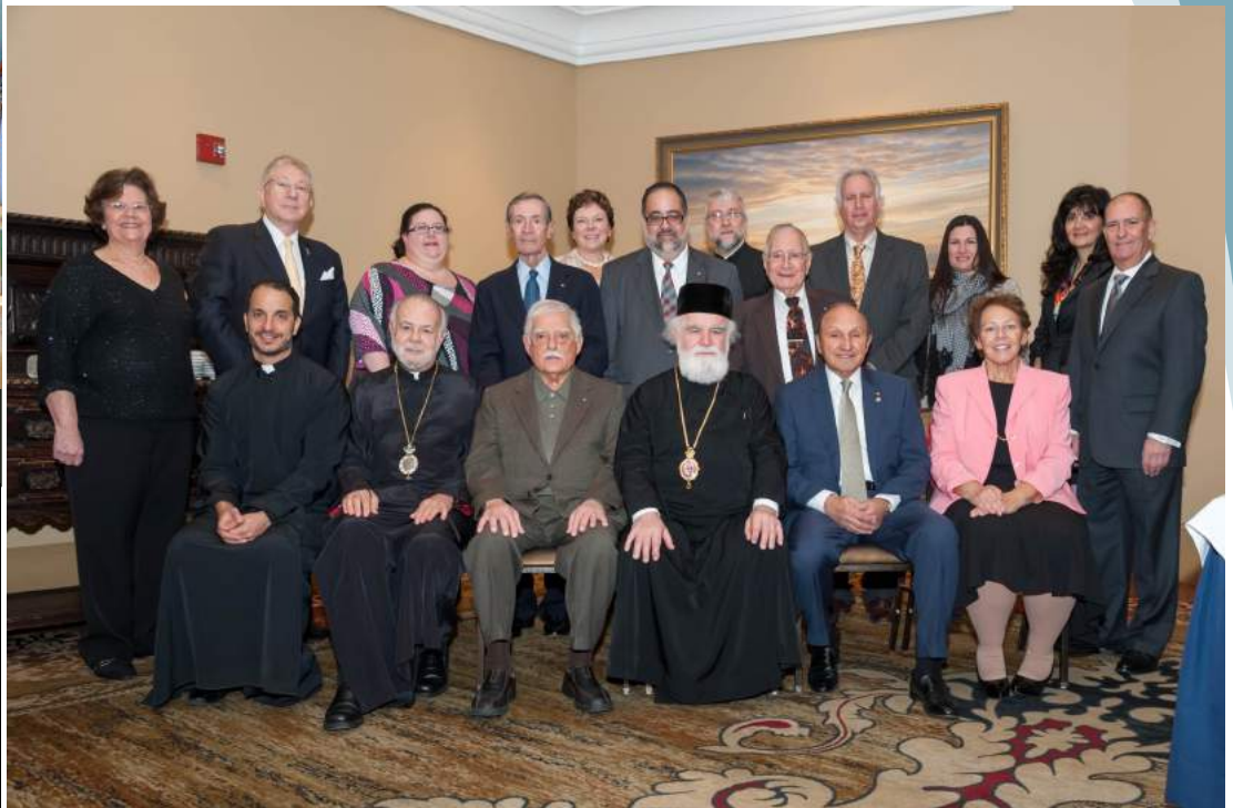
Trustees of the St. Photios National Foundation Convene for the 2016 St. Photios Foundation Annual Meeting