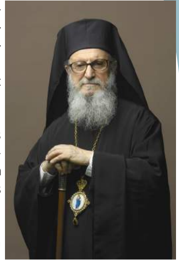
Archbishop Demetrios of America

The Saint Photios National Shrine offers a witness of Christ through our Orthodox Christian faith and our Hellenic heritage. The beautiful chapel invites visitors to reflect and pray in a very sacred space dedicated to God. In preserving the story of faith in the lives of our Greek forbearers who came to this land, the Shrine affirms the priority of faith in our lives as Greek Americans and Orthodox Christians.