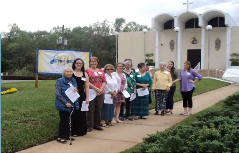
Pausing during the Morning Prayer Walk in front of St. John the Divine Greek Orthodox Church in Jacksonville, FL

For the first time in 25 years, the St. Anargyroi Ladies Philoptochos chapter held its annual retreat at its home parish of St. John the Divine in Jacksonville, FL. 32 women from the surrounding parishes of St. John the Divine, St. Justin the Martyr and Holy Trinity attended as well as one person from Holy Trinity, Clearwater.