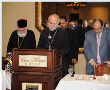
Bishop Dimitrios of Xanthos offers the Benediction