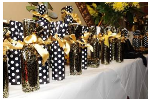
3rd Annual Wine Raffle