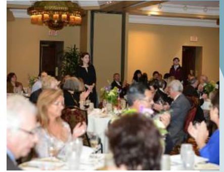
National Shrine Pilgrimage Banquet at the Casa Monica Hotel