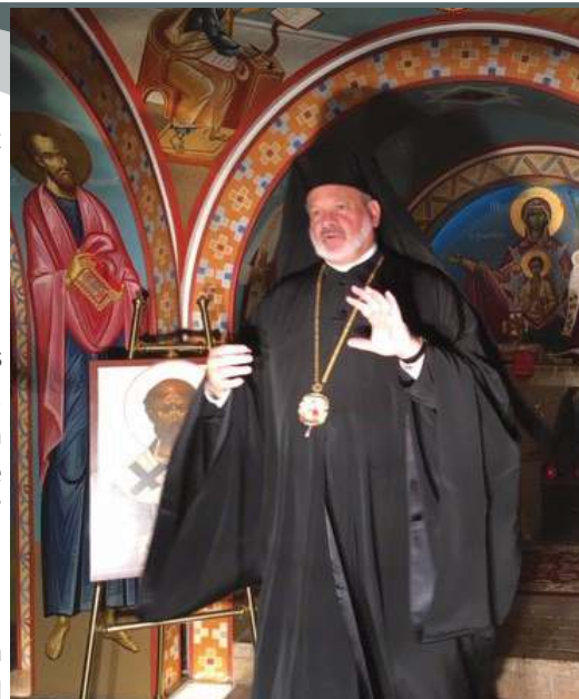
June 15, 2020—Chapel of St. Photios Orthodox Readings of Augustine (St. Vladimir's Seminary Press, 2008).