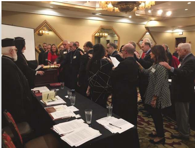
The St. Photios Foundation convened at 2:00 p.m. for its annual meeting where Archbishop Elpidophoros blessed the trustees, and inducted the new and current members unto the 2020-2022 St Photios Board of Trustees with the installation prayer.