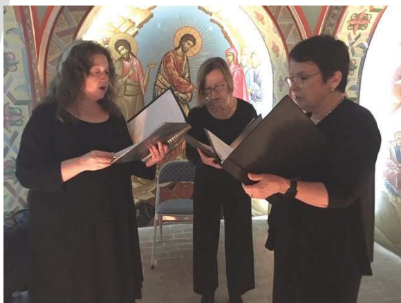
St. Augustine Cantorae