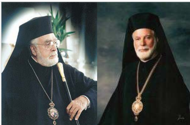
Of Blessed Memory, Archbishop Iakovos of America and Metropolitan Iakovos of Chicago