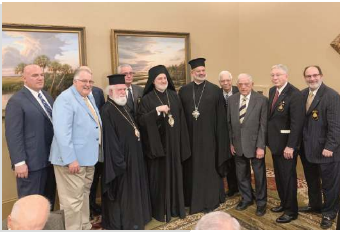
Archons of the Ecumenical Patriarchate of Constantinople