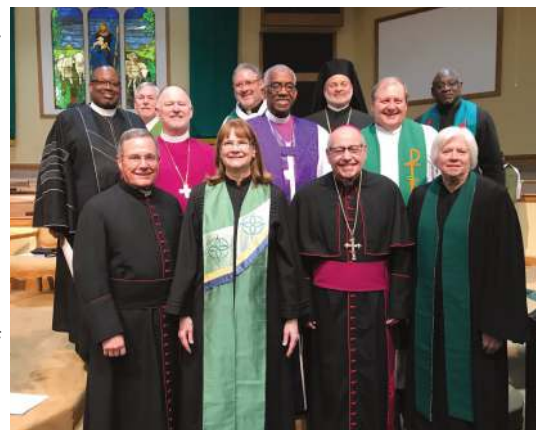
Seventh Annual Ecumenical Vespers at St. Paul A.M.E. Church, Jacksonville, FL