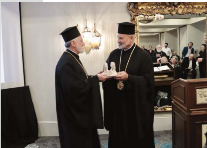
Presentation of the St. Augustine Lions