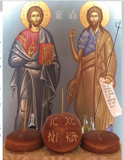
The five loaves were offered by the sisters of Annunciation Greek Orthodox Monastery in Reddick, FL.