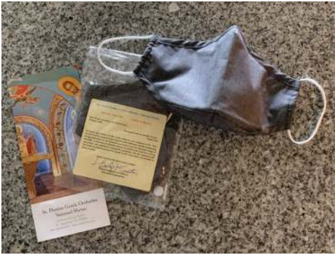
Protective Cloth masks sent to active and retired clergy.