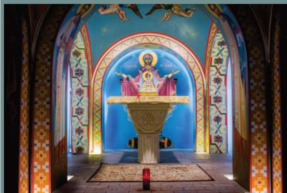
Paraklesis Services are held in the St. Photios Chapel on the 3rd Monday of the month at 12:30 p.m.

There are many sacred sites in our Greek Orthodox Archdiocese of America. A visit to the cathedrals and churches, shrines and monasteries is an edifying experience for the worshipping pilgrim. Upon arriving at one of these sites, an Orthodox Christian enters the narthex, offers gratitude to God with the sign of the Cross, makes an offering, and lights a candle. At that moment, as the candle pierces the darkness of the world outside, supplicants often focus their prayers to God on behalf of their loved ones.