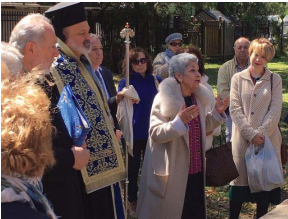
Memorial Presentation at the Tolomato Cemetery