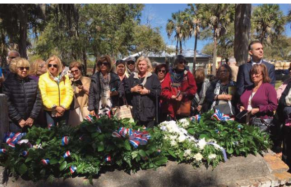
The Memorial at the Tolomato Cemetery