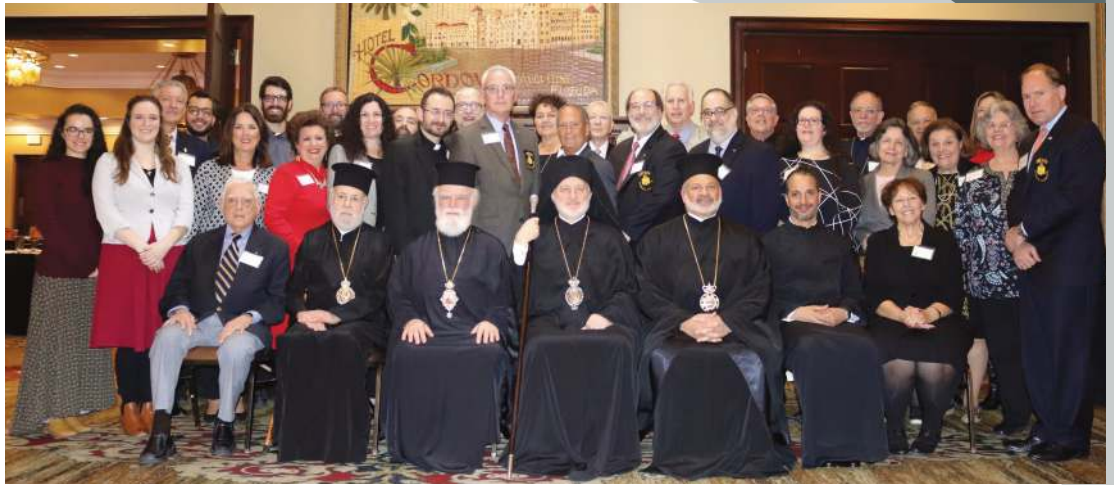
2020-2022 St. Photios Foundation Board of Trustees & visitors at the February 8th Annual Meeting