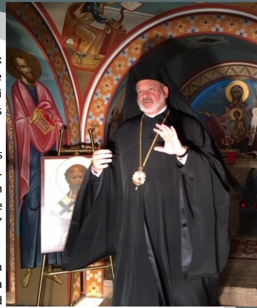
June 15, 2020—Chapel of St. Photios