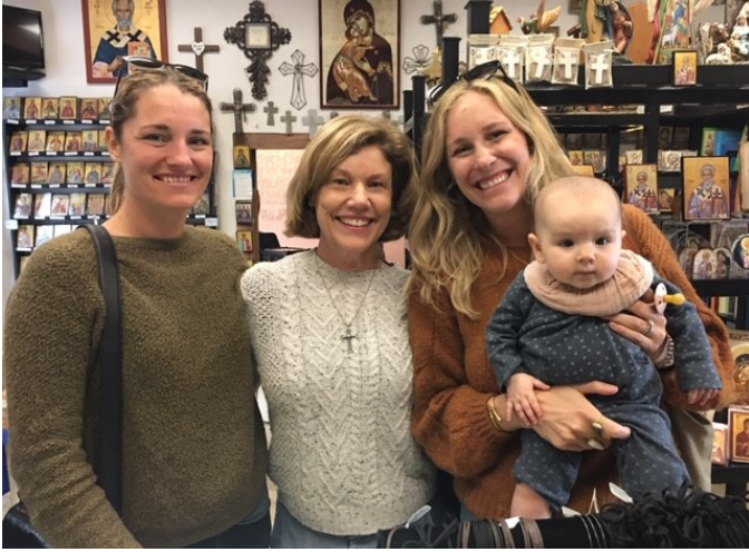
Three generations of Regas family