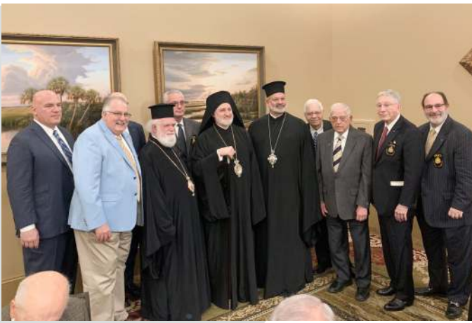
Archons of the Ecumenical Patriarchate of Constantinople