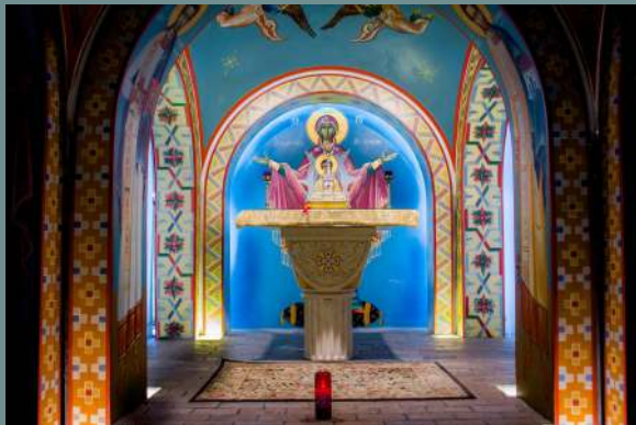
Paraklesis Services are held in the St. Photios Chapel on the 3rd Monday of the month at 12:30 p.m.

There are many sacred sites in our Greek Orthodox Archdiocese of America. A visit to the cathedrals and churches, shrines and monasteries is an edifying experience for the worshipping pilgrim. Upon arriving at one of these sites, an Orthodox Christian enters the narthex, offers gratitude to God with the sign of the Cross, makes an offering, and lights a candle. At that moment, as the candle pierces the darkness of the world outside, supplicants often focus their prayers to God on behalf of their loved ones.