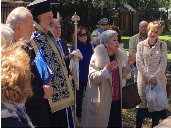
Memorial Presentation at the Tolomato Cemetery