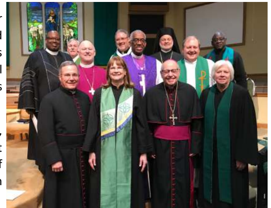
Seventh Annual Ecumenical Vespers at St. Paul A.M.E. Church, Jacksonville, FL