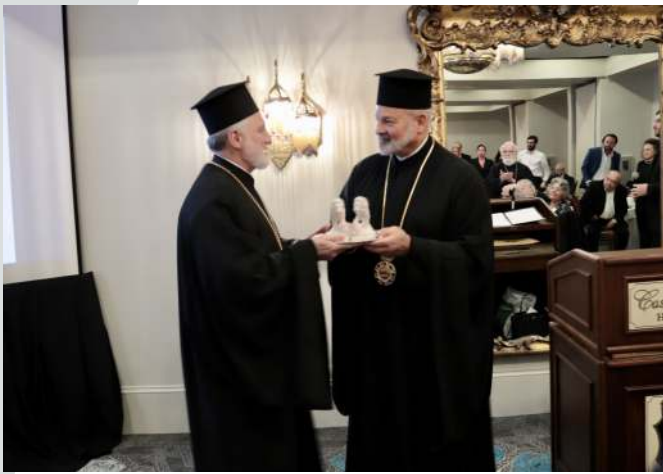
Presentation of the St. Augustine Lions