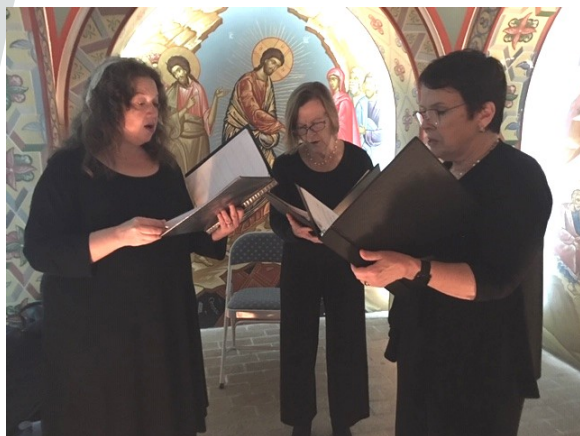
St. Augustine Cantorae