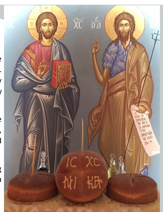
The five loaves were offered by the sisters of Annunciation Greek Orthodox Monastery in Reddick, FL.