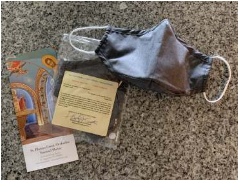
Protective Cloth masks sent to active and retired clergy.