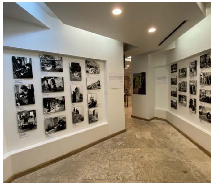
The Special Benaki Museum Exhibit 2020