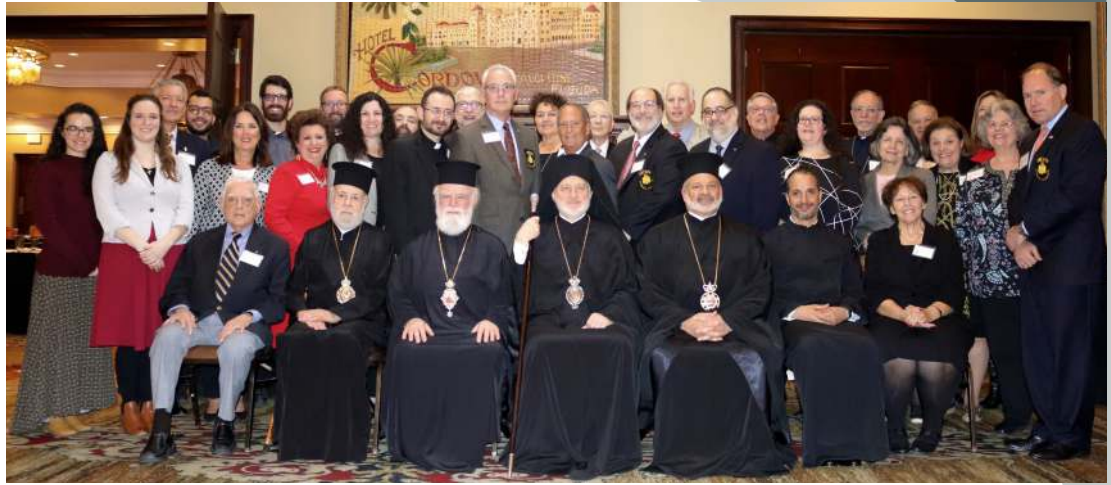
2020-2022 St. Photios Foundation Board of Trustees & visitors at the February 8th Annual Meeting