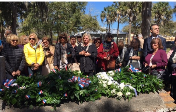
The Memorial at the Tolomato Cemetery