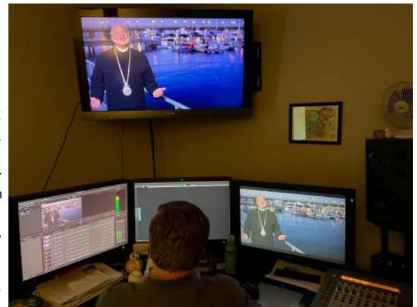
Spectrum Films making final edit to the Award Winning Greek Landing Day video