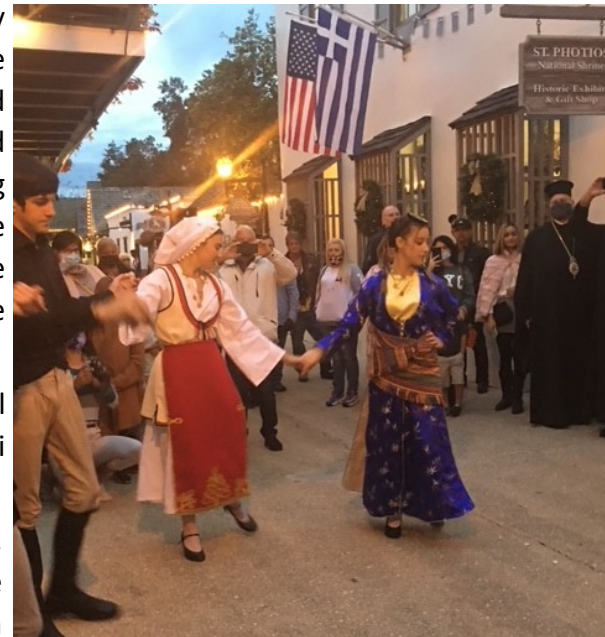
St. Demetrios Folk Dancers of Daytona Beach, Florida, dance on St. George Street