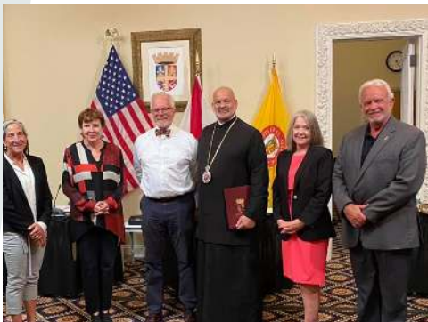
Presentation of City Proclamation To Bishop Demetrios of Mokissos at City Council Meeting