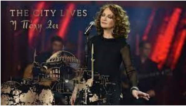
The City Lives by Glykeria