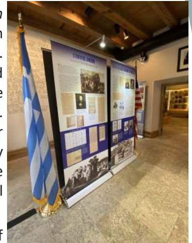
Special Exhibit at the St. Photios National Shrine