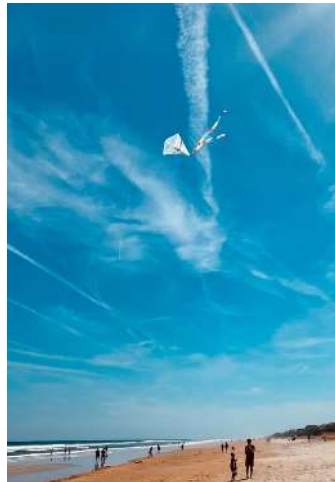
A successful event at St. Augustine Beach