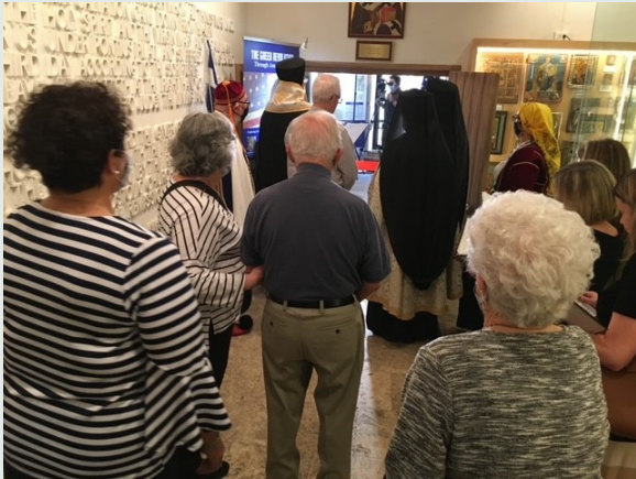
Cutting the Ribbon of the Greek Revolution Through Their Eyes Special Exhibit