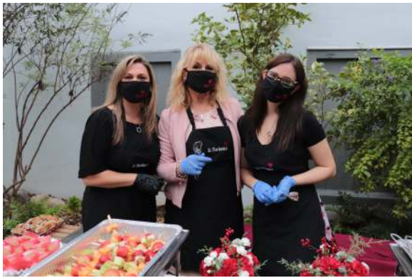
Hospitality at the Christmas Open House provided by the St. Barbara Philoptochos of St. Demetrios, Daytona Beach, FL

Collectively, the chapter of the National Ladies Philoptochos Society have donated over $500,000 to St. Photios National Shrine over the years through its annual commitment program. The Philanthropic arm of the Greek Orthodox Archdiocese of America continues to provide financial assistance to the preservation of the National Shrine, while encouraging awareness and involvement in the life and programs of the first National Shrine of our Archdiocese.