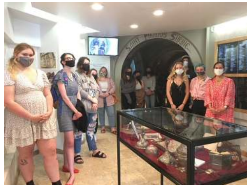
Flagler College History and Arts Students Mixed Media in Religion Presentation