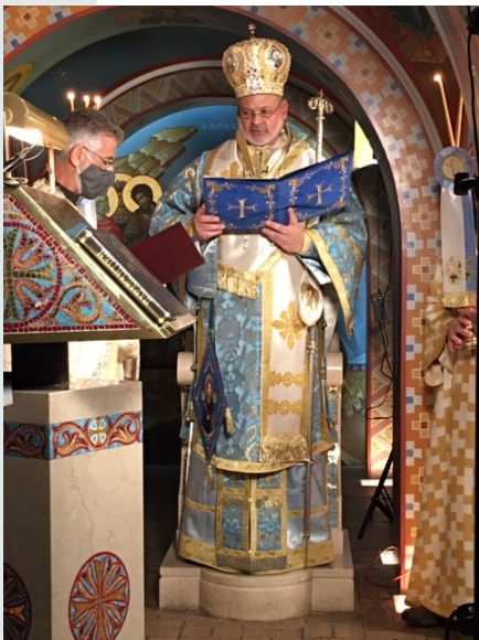
Bishop Demetrios of Mokissos celebrating the Feast of St. Demetrios on October 26, 2020

Every third Monday of the month, ecclesiastical services are livestreamed from the chapel of St. Photios at 12:30 p.m., Eastern time, except during the period of Great Lent when Compline is chanted.