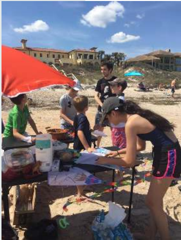
Kathara Deftera and Kites