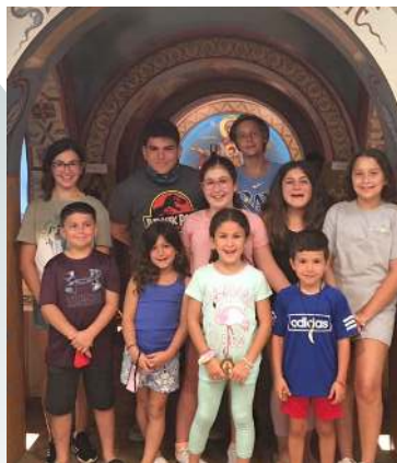
Tarpon Springs Visitors