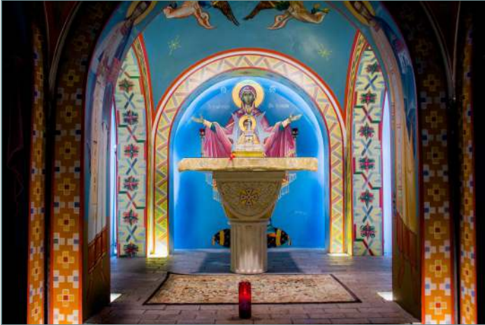
St. Photios Chapel

There are many sacred sites in our Greek Orthodox Archdiocese of America. A visit to the cathedrals and churches, shrines and monasteries is an edifying experience for the worshiping pilgrim. Upon arriving at one of these sites, an Orthodox Christian enters the narthex, offers gratitude to God with the sign of the Cross, makes an offering, and lights a candle. At that moment, as the candle pierces the darkness of the world outside, supplicants often focus their prayers to God on behalf of their loved ones.