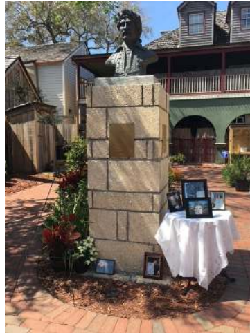
Bust of Ioannis Ioannopolis in the Garden of Educators at the Oldest Schoolhouse