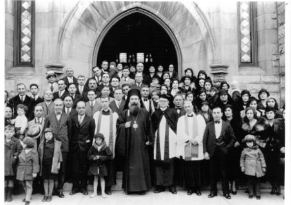
Parish Visit to Newport News, VA