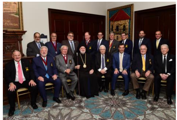
Archons of the Ecumenical Patriarchate