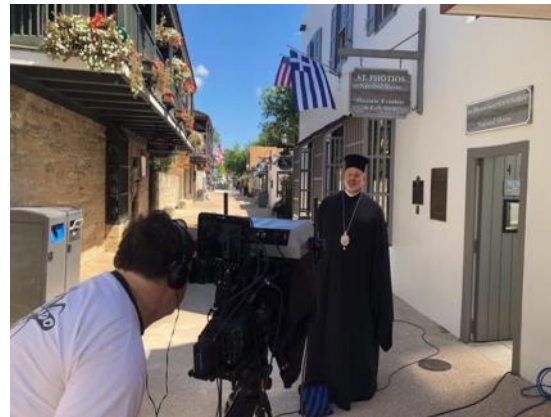
Filming on location with the crew from Spectrum Films.

His Grace launched a children's drawing contest in conjunction with the annual commemoration of the Fall of Constantinople.