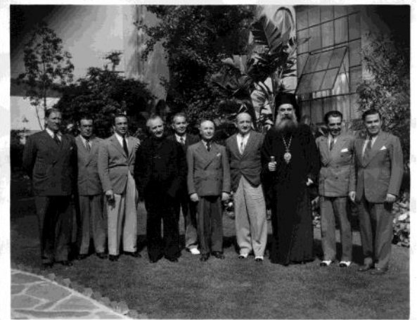
1938 Pastoral visit to Hollywood, CA