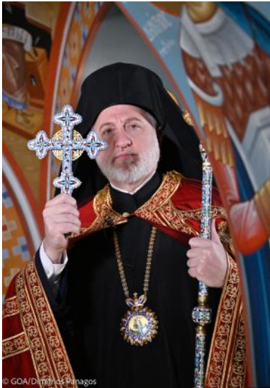
His Eminence Archbishop Elpidophoros of America in the Chapel of St. Photios.