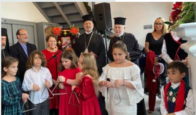
The Kalanta with the Children of Holy Trinity parish in St. Augustine.