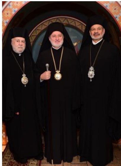
Metropolitan Dimitrios of Xanthos, Archbishop Elpidophoros of America and Bishop Demetrios of Mokissos.