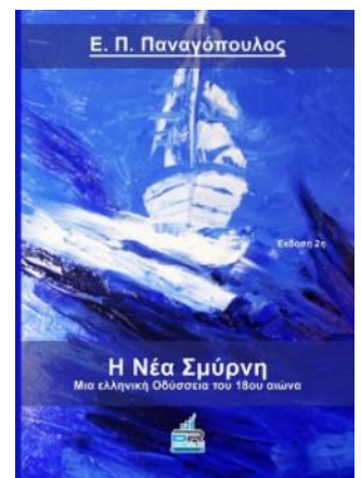
The Greek edition of the New Smyrna Colony

Search and Find , children's and junior editions, along with many other items including children's prayer cubes and prayer ropes can be easily shipped to your home in time for Christmas! Call 904-829-8205 to place your order.