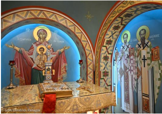
St. Photios Chapel

Paraklesis, in ecclesiastical language, means supplication. But it also means consolation. The Church holds the Paraklesis, where the faithful convey their requests to the Virgin Mary, but at the same time, they seek consolation from the Mother of God.