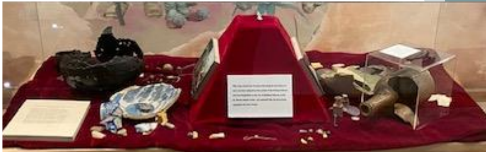
Artifacts found during the 1977 excavation on display at the St. Photios National Shrine and Museum

Five different archaeological teams excavated the property between 1971 and 1977. Over 1,000 artifacts were catalogued with the majority stored at the University of Florida and 30 on exhibit in the Shrine museum.