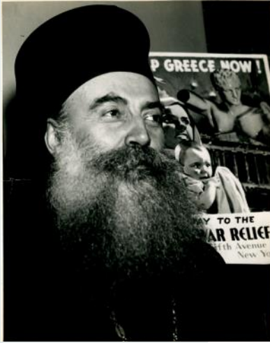
Archbishop Athenagoras War Relief

Special museum exhibitions are prepared over the course of time with meticulous attention to detail, involving many people in the process. Many Shrine pilgrims plan their annual visit year to year expecting to see the new exhibit, knowing it is up for a full calendar year.